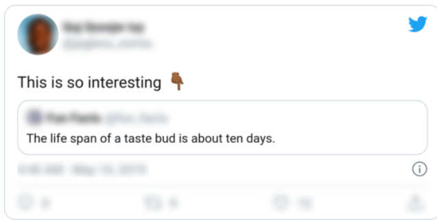
Figure 1: Example of a critical trial from one block, showing manipulation of the identity encoded in profile photos and emoji.

(2010), with the main difference that it was conducted online. Participants were shown 31 tweets containing trivia and informed that the trivia could be true or false. Their task was to mark on a slider from 0 to 100 whether they thought the trivia was definitely false or definitely true . Participants were explicitly asked not to look up any trivia and informed that the correct answers would be shown upon completion of the study.